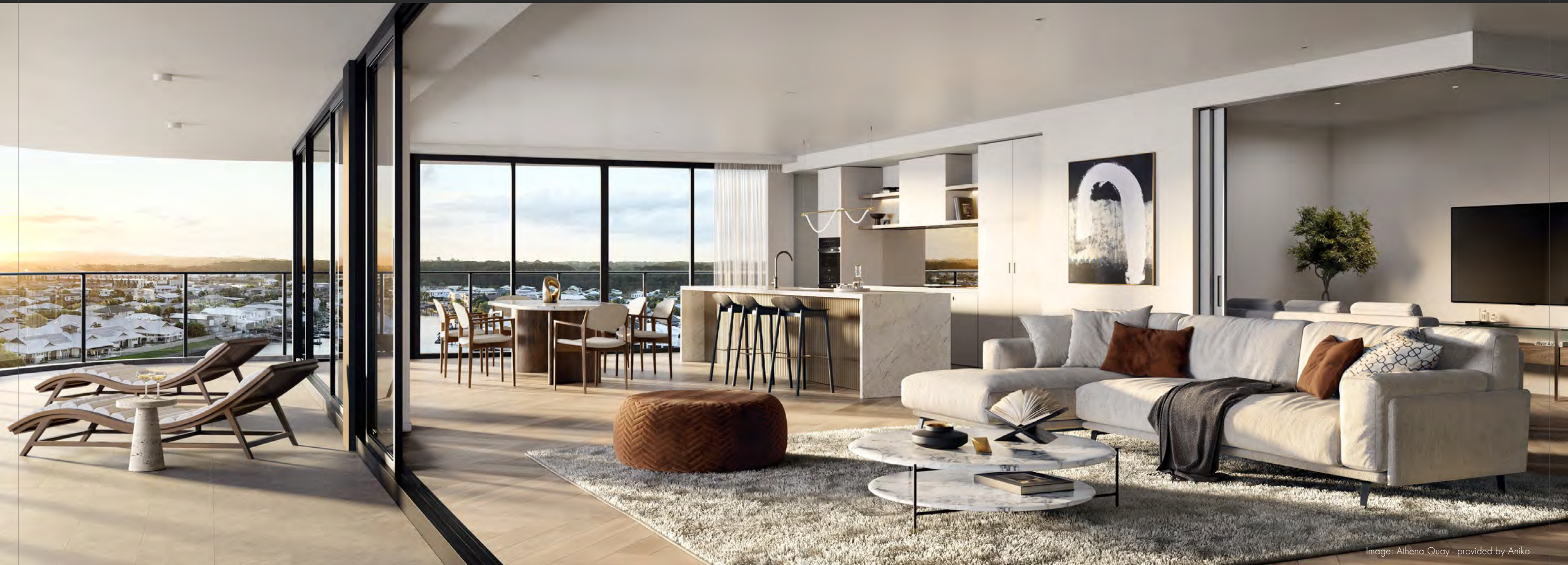
Image: Athena Quay

At Archidiom, we cultivate a dynamic, collaborative culture where innovation thrives. We streamline design and construction, working closely with clients and consultants for efficiency. Embracing contemporary details and cutting-edge solutions, we create impactful built environments that elevate architecture and enrich communities.